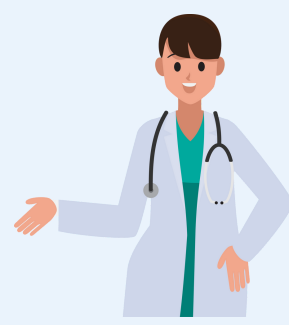
General Practitioners (44%)