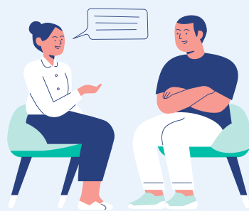
Occupational Therapists (60%)