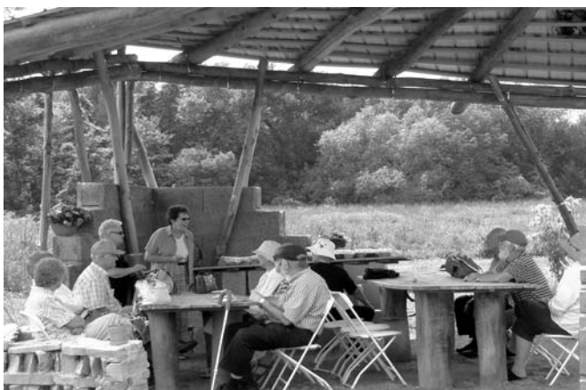
Sharing a joke at Fifth Town