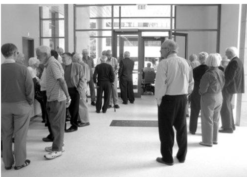
Gathering in the Lobby