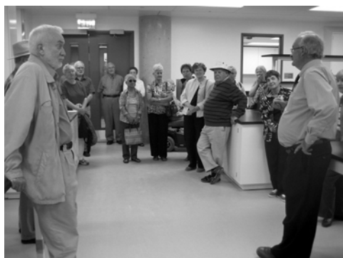
A Biochemistry Lab