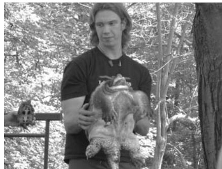
Turtles and friend at Lake Opinicon

The annual RAQ potluck picnic was held at the Queen's Biological Research Station on Lake Opinicon on July 27 th . As usual, RAQ members supplied the food, and the student researchers at Opinicon supplied the speakers. Their topic was inventing devices for saving turtles from drown-