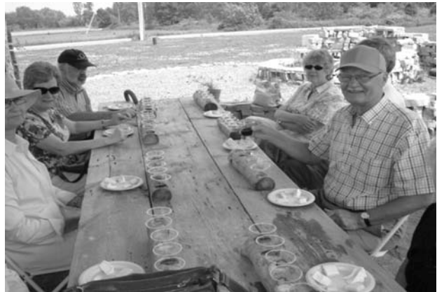
Sampling wine and cheese