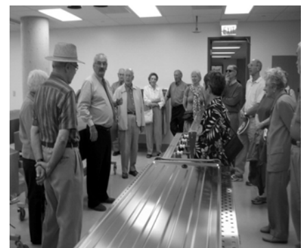
An Anatomy Lab