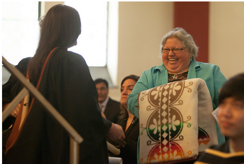
Blanket presentation, Spring Convocation