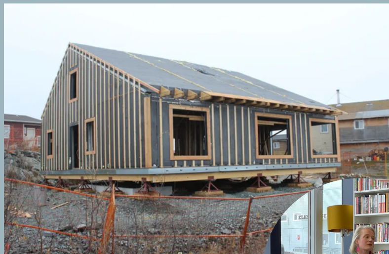
Above: A house under construction in Dettah.