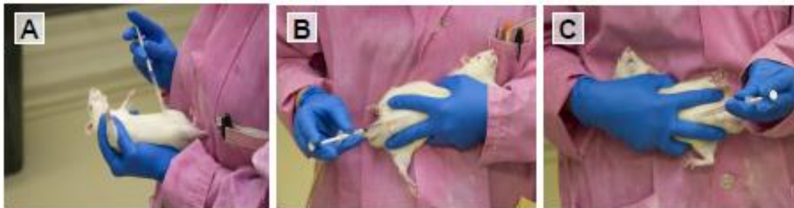
Figure 3. Novel hold for IP injections in rats. A) Standard suspender hold; B) Novel roll-over hold (right-handed user); C) Novel roll-over hold (left-handed user).

Novel IP restraint technique: This hold was developed for animals that are accustomed to handling. It alleviates stress to the animal, and allows for clear visualization of the needle hub.