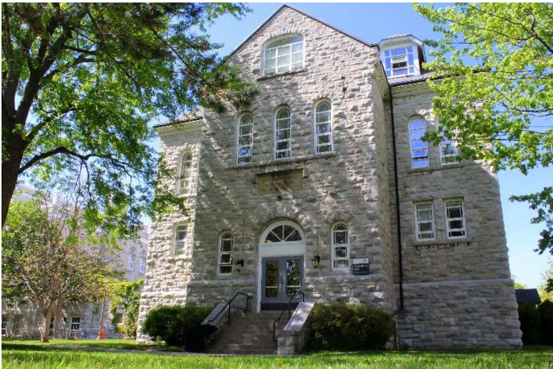
Carruthers Hall, Queen's University