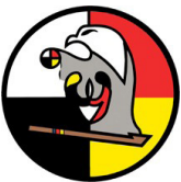
Four Directions Indigenous Student Centre