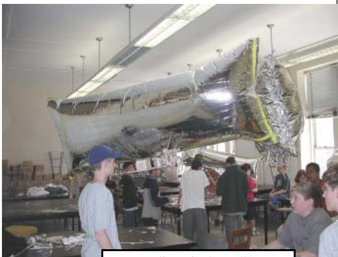
"Blimps in the Hall"