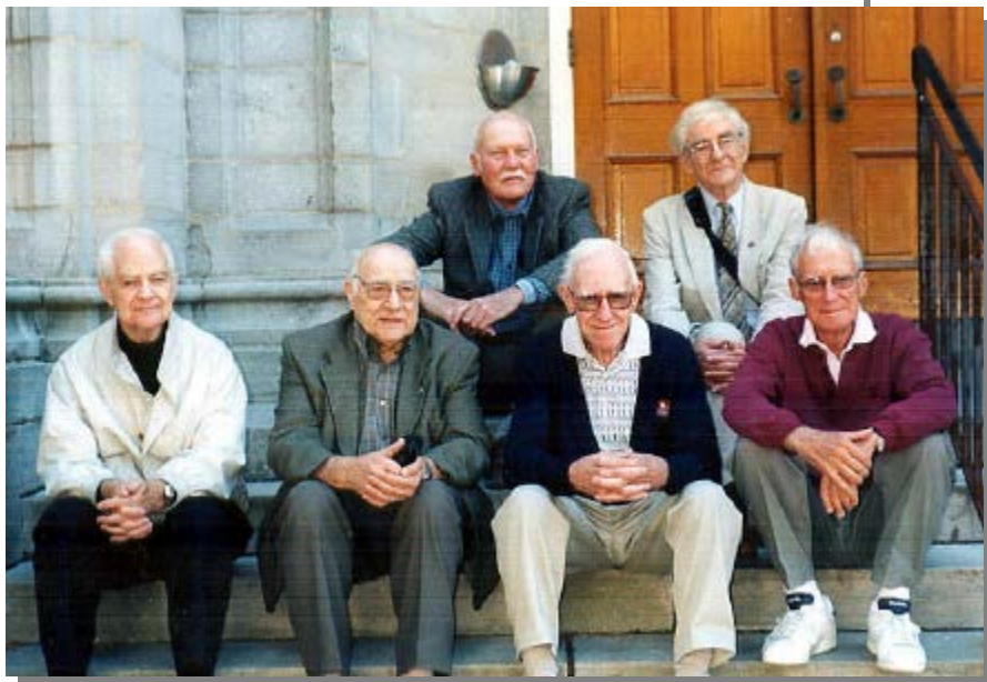
Fiftieth Anniversary Reunion of Queen's Geology Grad Students September 27-29, 2002.