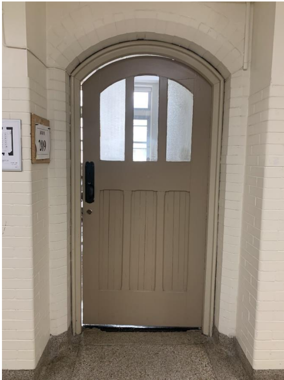
Image Description: The entrance is a beige door with a doorknob on the left side of the door.

For more information about accessibility on campus, please refer to the Accessibility Hub or the Facilities Building Directory .