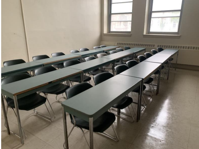
Image Description: Instructors perspective from the podium. There are three rows of tables and chairs facing the front of the room.