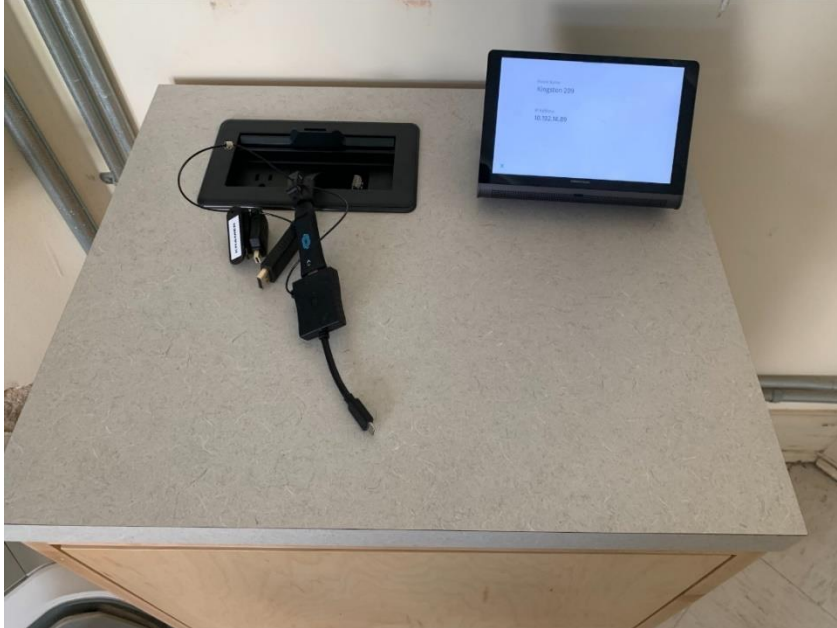
Image Description: Small podium is equipped with a set of connection cords to present media as well as volume control.