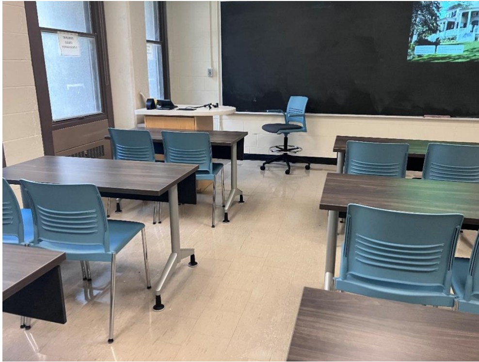
Image Description: View of the classroom from a student seat near the rear of the room. In front are multiple empty rows of tables and chairs. The instructor podium is at the front of the room on the left. Two blackboard panels are located on the front wall. A projector on the ceiling projects onto a screen that extends from the ceiling. This classroom is accessible for students.