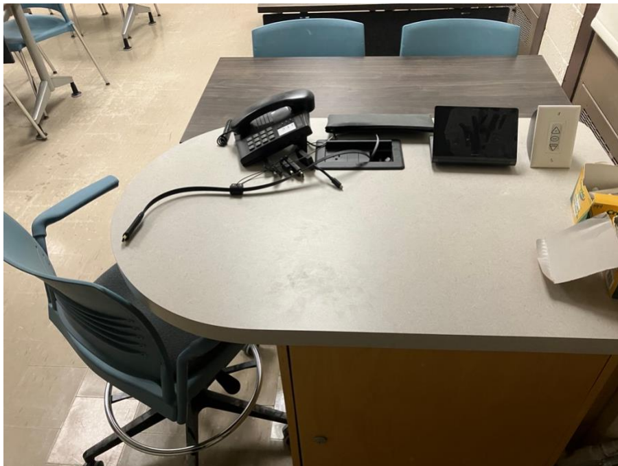
Image Description: Top-down view of the podium. The instructor's podium is equipped with a set of cabled for media display and a telephone. The room is accessible for instructors.

Image Description: View of the classroom from a student seat near the rear of the room. In front are multiple empty rows of tables and chairs. The instructor podium is at the front of the room on the left. Two blackboard panels are located on the front wall. A projector on the ceiling projects onto a screen that extends from the ceiling. This classroom is accessible for students.