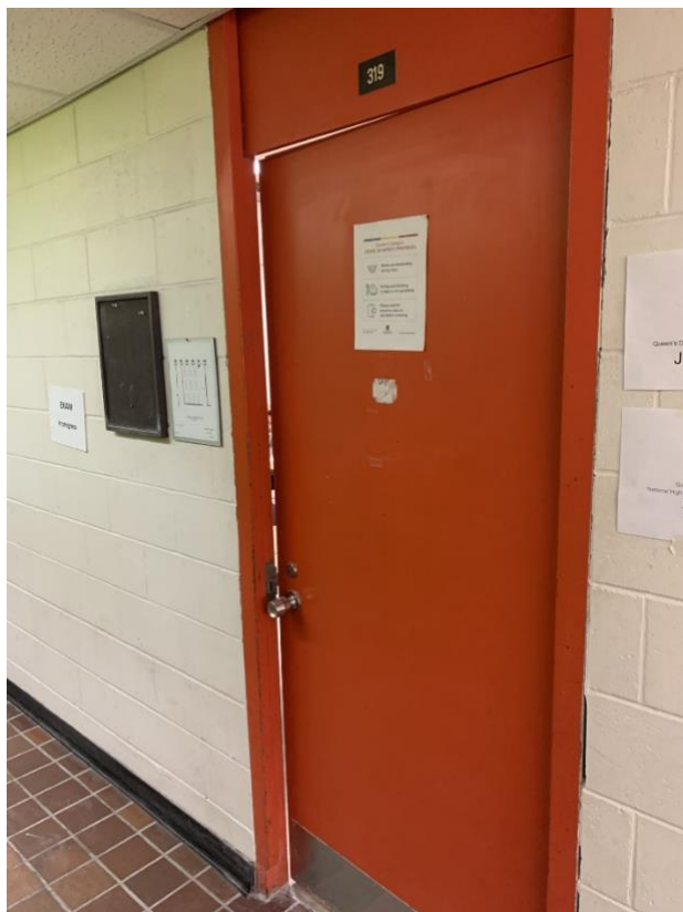
Image Description: The entrance to room 319 is a red door with a doorknob on the left side.