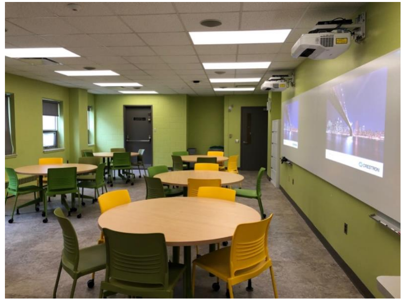
Image Description: View of the classroom from the instructor's podium. There are multiple round tables with chairs for students. Two projectors on the ceiling project onto screens on the right hand side of the room. This classroom is accessible for instructors.

Image Description: Image of the podium at the front of the classroom. This podium is not movable or height adjustable. A phone is located on the left side of the podium. This podium is not accessible.