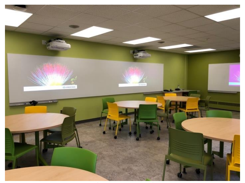
Image Description: View of the classroom from a student seat near the rear of the room. In front are multiple round tables and chairs. The instructor podium is at the front of the room on the left. Digital projectors on the ceiling, projects onto screens on the front wall and left wall. This classroom is accessible for students.

For more information about accessibility on campus, please refer to the <u>Accessibility Hub</u> or the <u>Facilities Building Directory</u>.