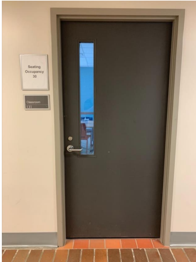
Image Description: The entryway of room 131 in Humphrey Hall is a single grey door with a silver handle on the left side of the door.