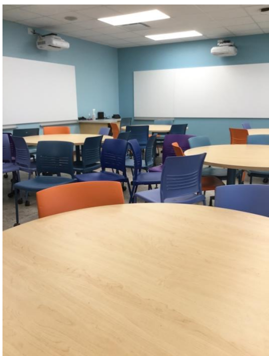
Image Description: View of the classroom from a student seat near the rear of the room. In front are multiple round tables with chairs. The instructor podium is at the front of the room on the left. Two projectors project onto screens that are located across the front wall, as well as the left wall (from the perspective of a student). This classroom is accessible for students.

For more information about accessibility on campus, please refer to the Accessibility Hub or the Facilities Building Directory .