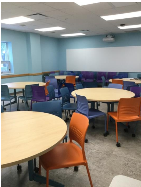
Image Description: View of the classroom from the instructor's podium. There are multiple round tables with chairs for students. A projector projects onto a screen, located at the back of the room. This classroom is accessible for instructors.