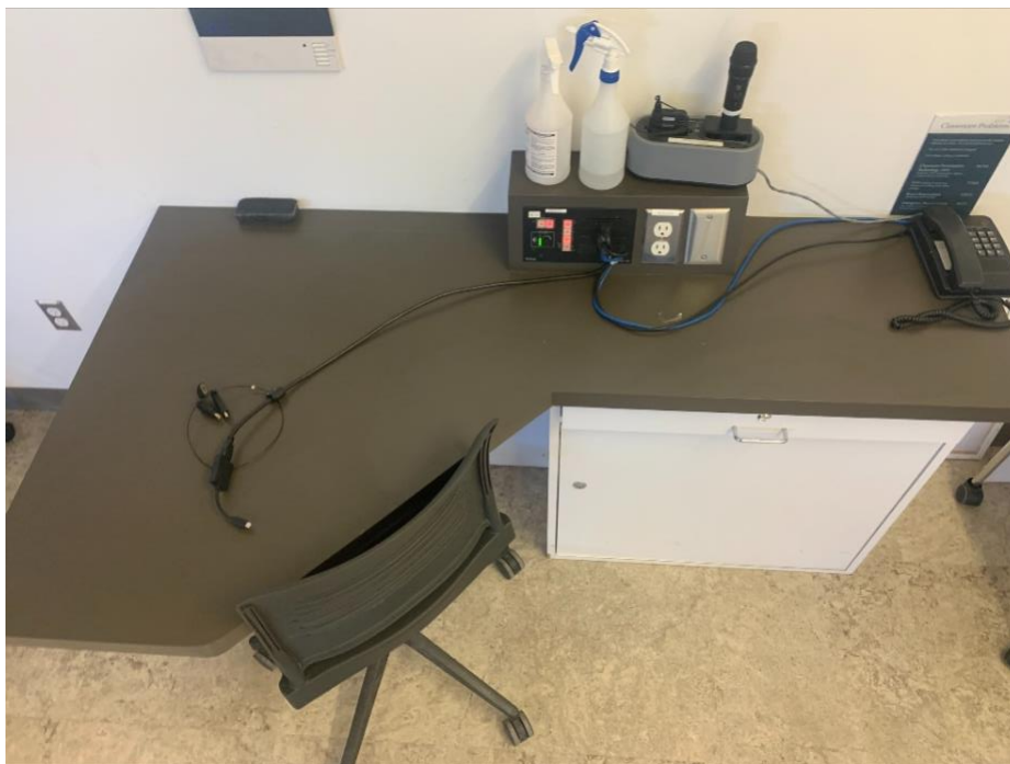
Image Description: Podium is equipped with a phone, an outlet, lecture capture and a set of microphones. There is a phone located on the right side of the desk.

Image Description: The entryway of classroom 319 in Ellis Hall is a grey door with a silver handle on the right side of the door.