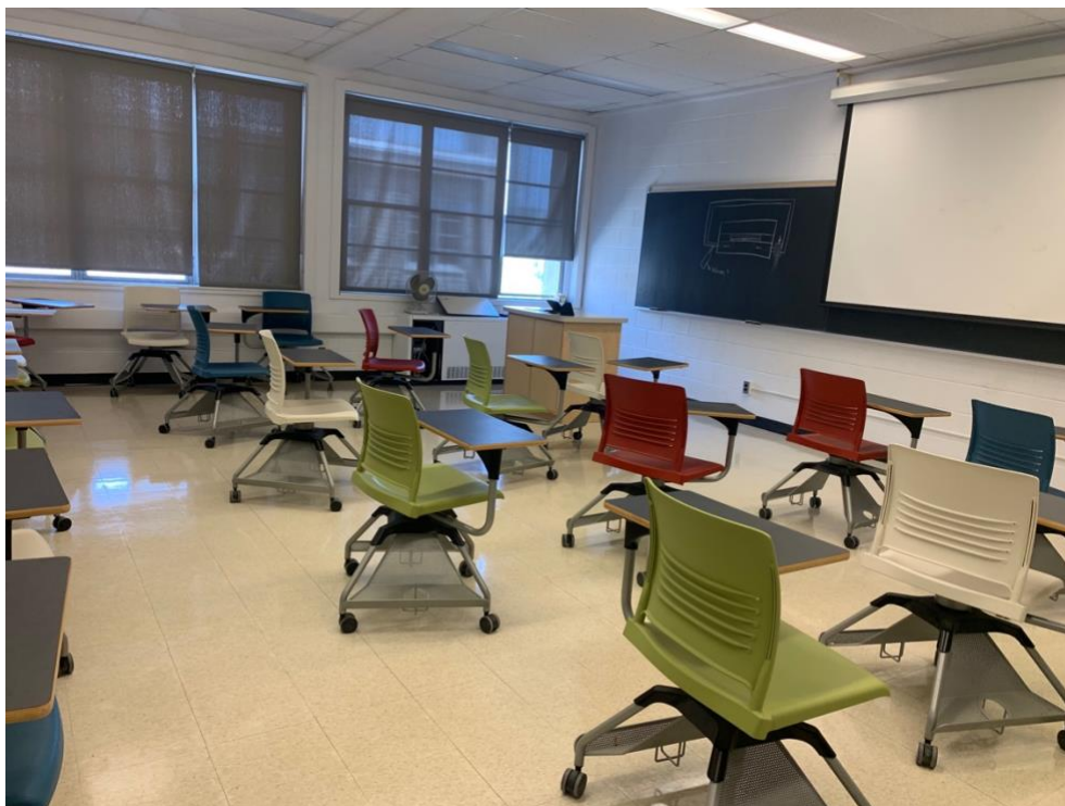
Image Description: View of the classroom from a student seat at the rear of the room. The podium is at the front left side of the classroom, and there are whiteboards across the front of the room. There is a projector that can present media on a screen that pulls down from the ceiling.

For more information about accessibility on campus, please refer to the Accessibility Hub or the Facilities Building Directory .