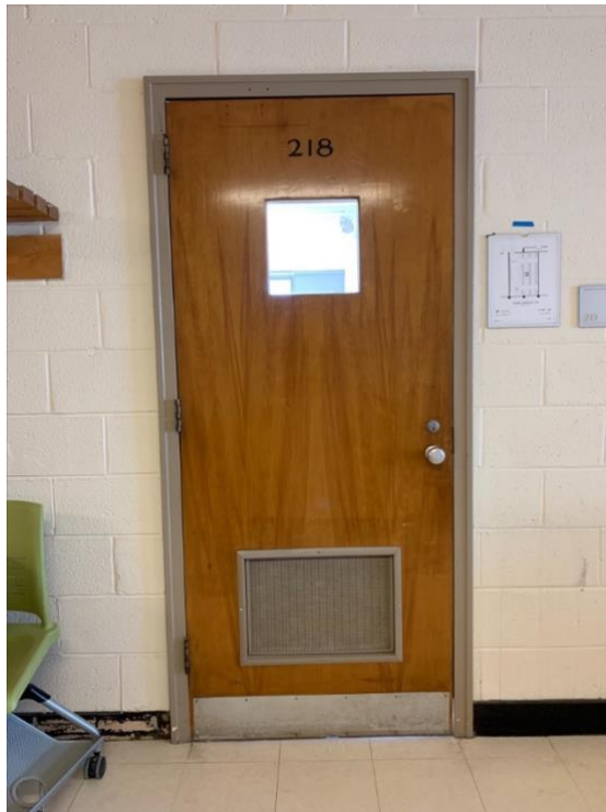
Image Description: Door for room 218 in Ellis Hall, the doorknob sits on the right side of the door.