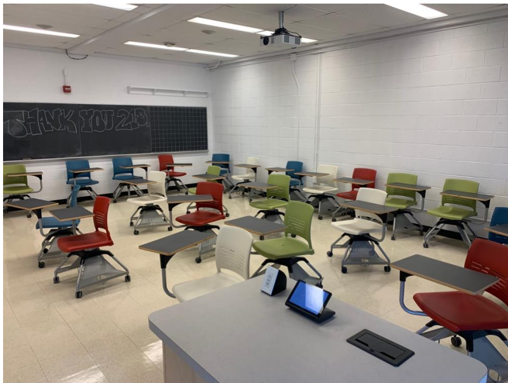
Image Description: Instructors view while standing at the podium. Seats are moveable and each have a tablet arm. Chairs can be arranged as preferred by the instructor. The room is accessible for students.

Image Description: Door for room 218 in Ellis Hall, the doorknob sits on the right side of the door.