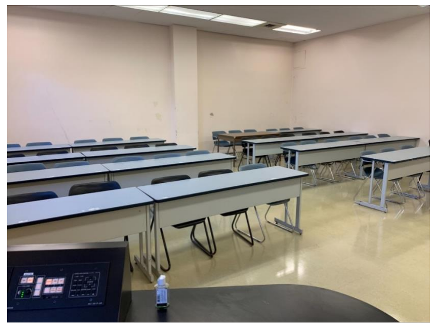
Image Description: View of the classroom from the podium. The student tables and chairs are arranged in four rows facing the front of the room. Both the tables and chairs are portable and can be arranged as needed in the room.

Image Description: View of the classroom from a student seat near the rear of the room. In front are three empty rows of tables and chairs. The instructor podium is at the front of the room on the right. The front of the classroom has a large blackboard in the middle of the front wall. Two digital projectors on the ceiling, project onto two screens on the front wall on either side of the blackboard. This classroom is accessible for students.