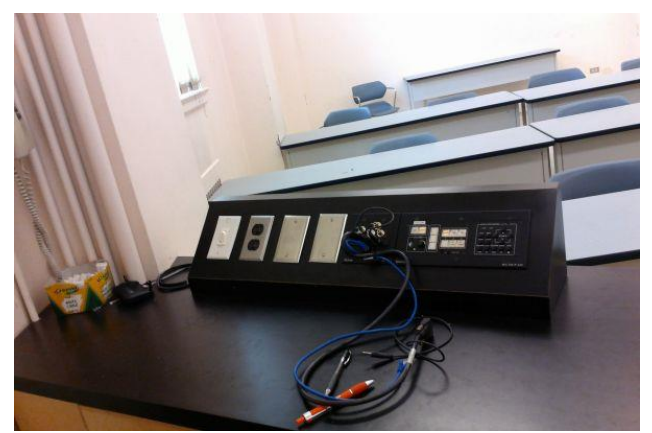
Image Description: View of the classroom from the instructor's podium. There are 7 long curved tables with chairs for students. Tables are arranged in rows from front to back with tiered steps to access tables in the middle and back area of the classroom. The entryway door is located at the left side of the image. This classroom is accessible for instructors.

Image Description: The entryway of room 10 in Dunning Hall is a tan door with a silver doorknob on the left side.