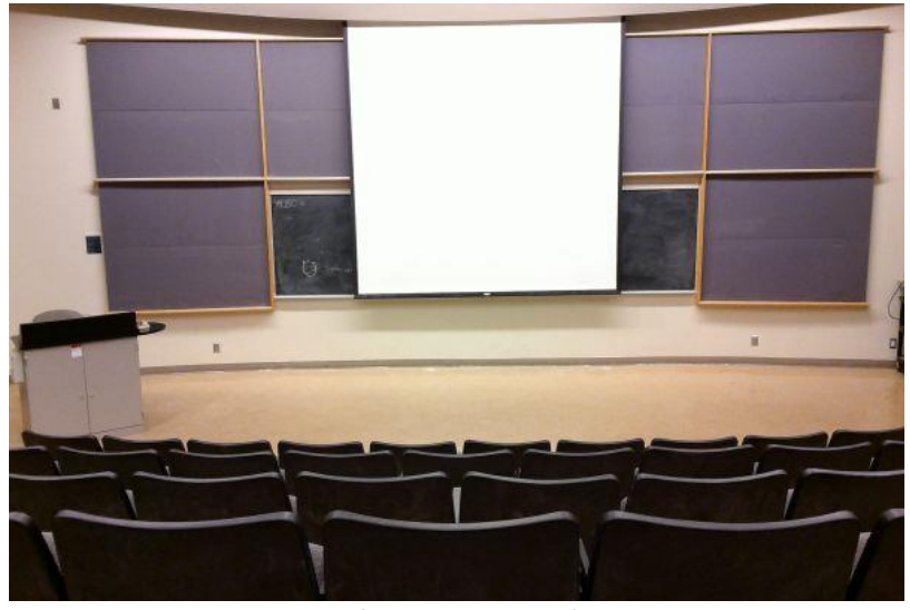
Image Description: View of the classroom from a student seat at the rear of the room. Instructor's podium is located at the front of the room on the left-hand side (from a student's point of view). Sliding blackboards are located on the front wall. A digital projector on the ceiling projects onto a screen, which extends from the ceiling. The entryway door is located on the right side of the image. This classroom is accessible for students.

Image Description: View of the classroom from the instructor's podium. The classroom has seven rows of chairs, with tiered steps to access tables in the middle and back area of the classroom. The entryway door is located at the back of the classroom on the left-hand side. This classroom is not accessible for instructors.