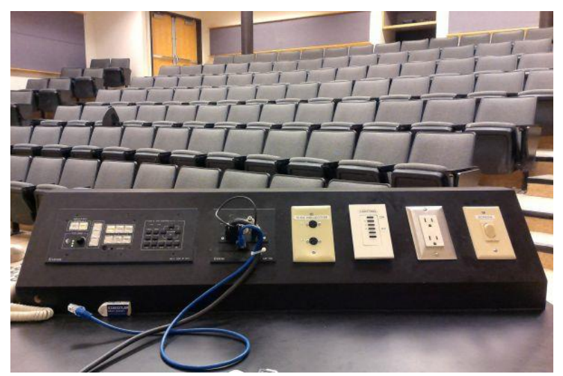
Image Description: View of the classroom from the instructor's podium. The classroom has seven rows of chairs, with tiered steps to access tables in the middle and back area of the classroom. The entryway door is located at the back of the classroom on the left-hand side. This classroom is not accessible for instructors.