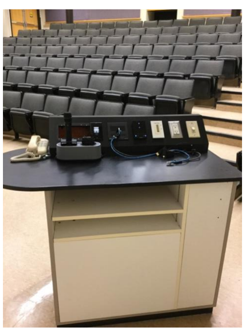
Image Description: Image of the podium at the front of the classroom, on the right-hand side. A phone is located on the left side of the podium. This podium is not moveable or height adjustable. This podium is not accessible.

Image Description: Entryway door to Chernoff Hall room 117 classroom. Doorway is a wooden double door, with two handles in the middle.