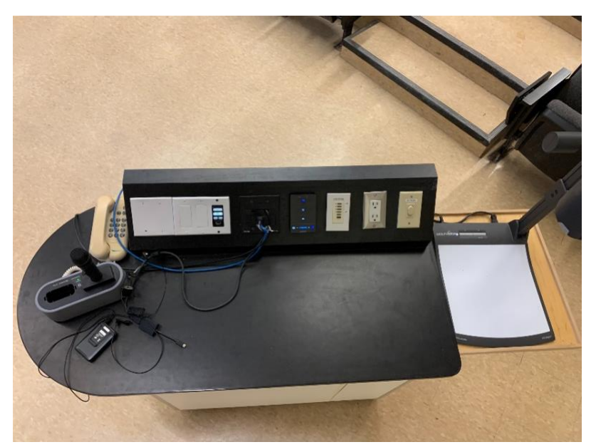
Image Description: The podium is equipped with a document camera, lecture capture, a set of microphones and connection cords to project media.

For more information about accessibility on campus, please refer to the <u>Accessibility Hub</u> or the <u>Facilities Building Directory</u>.