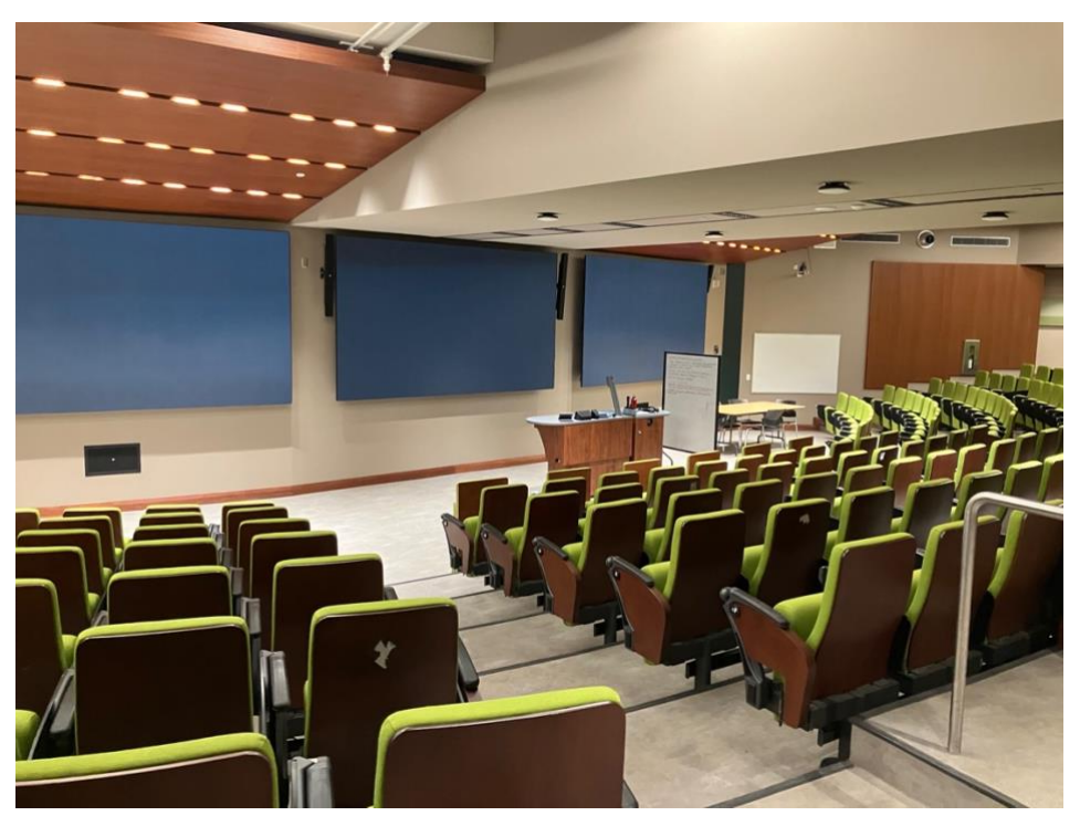
Image Description: View of the classroom from a student seat at the rear of the room. Instructor's podium is located at the front of the room. A whiteboard is located on the right wall, close to the instructor's podium. There are three video walls at the front of the room. This classroom is accessible for students.