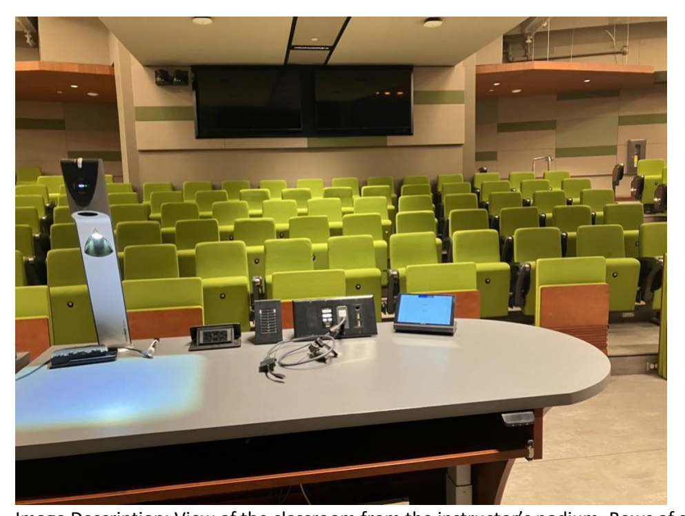
Image Description: View of the classroom from the instructor's podium. Rows of seating are tiered, and each seat had a tablet arm. The entryway door is located at the rear of the room. This classroom is accessible for instructors.

Image Description: Entryway door to Biosciences complex, room 1102. There are two sets of double doors with handles that pull to open. Both doors can be opened by pressing the automatic door opener beside the entrance.