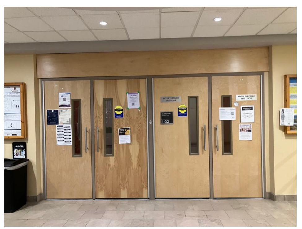
Image Description: Entryway door to Biosciences complex, room 1102. There are two sets of double doors with handles that pull to open. Both doors can be opened by pressing the automatic door opener beside the entrance.