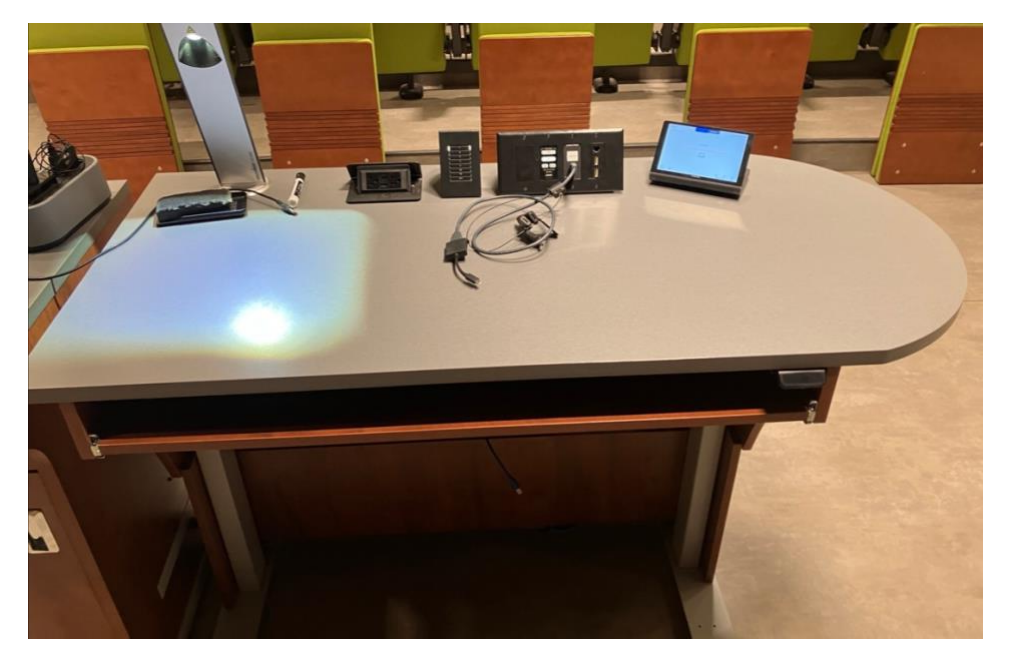
Image Description: Top down view of the podium. This podium is equipped with a set of microphones, a document camera, lecture capture and wireless presentation. The podium is height adjustable.

Image Description: View of the classroom from a student seat at the rear of the room. Instructor's podium is located at the front of the room. A whiteboard is located on the right wall, close to the instructor's podium. There are three video walls at the front of the room. This classroom is accessible for students.